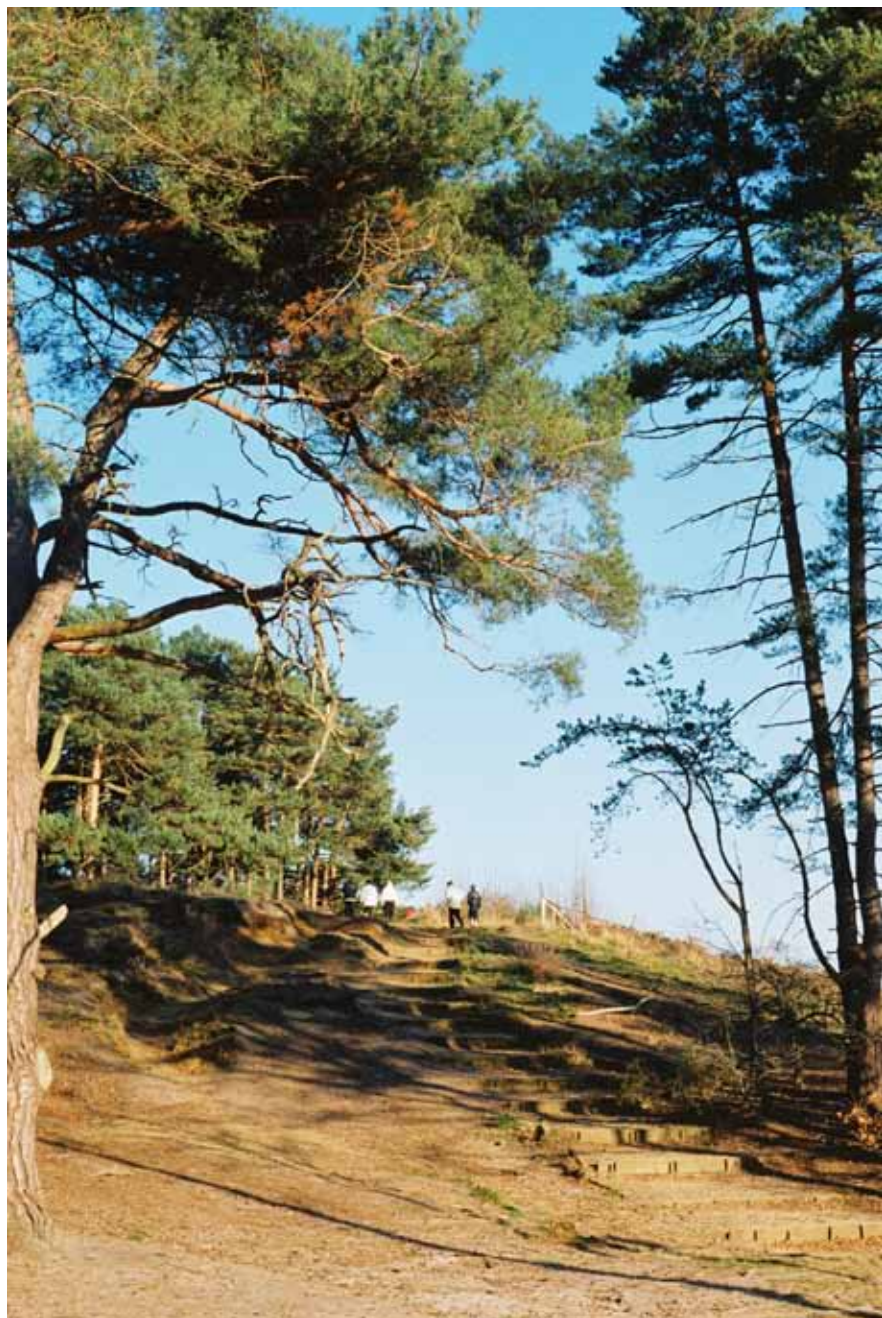
Oxshott Heath showing recently cleared areas, 26 December 2008