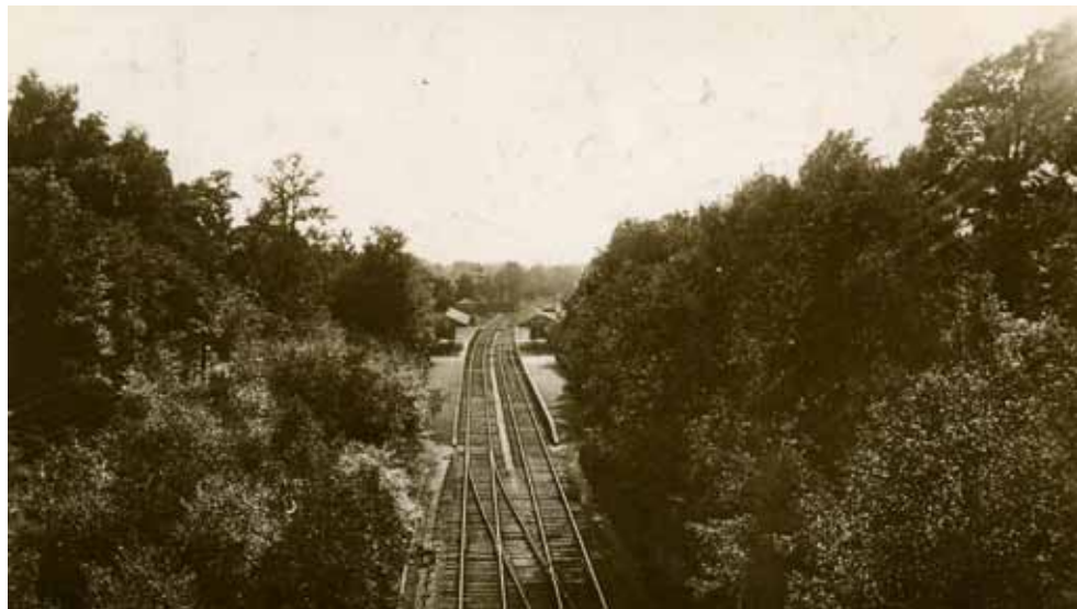
Scovell postcard of Oxshott Station from Warren Lane bridge, postmarked 20 July 1914