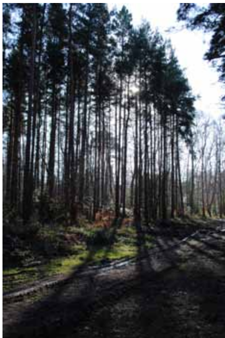
Esher Common, 30 January 2010